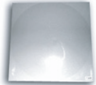
Azimuth Radiation Pattern